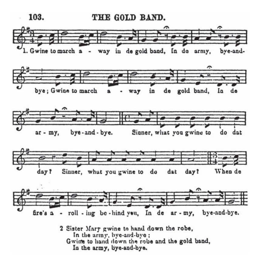
"The Gold Band," in Slave Songs of the United States , edited by William Francis Allen, Charles Pickard Ware, and Lucy McKim Garrison.A. Simpson, 1867; reprint, Dover Publications, 1995.